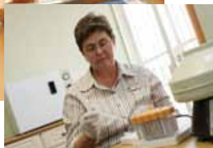
The MatCH research center in Edendale, South Africa, was established in 2007 with support from IPM. We also completed renovations that year to three other research centers in South Africa: Madibeng Centre for Research, the Prevention of HIV/AIDS Project, and the Qhakaza Mbokodo research center. All four centers have conducted IPM research studies and are now participating in our Phase III Ring Study.