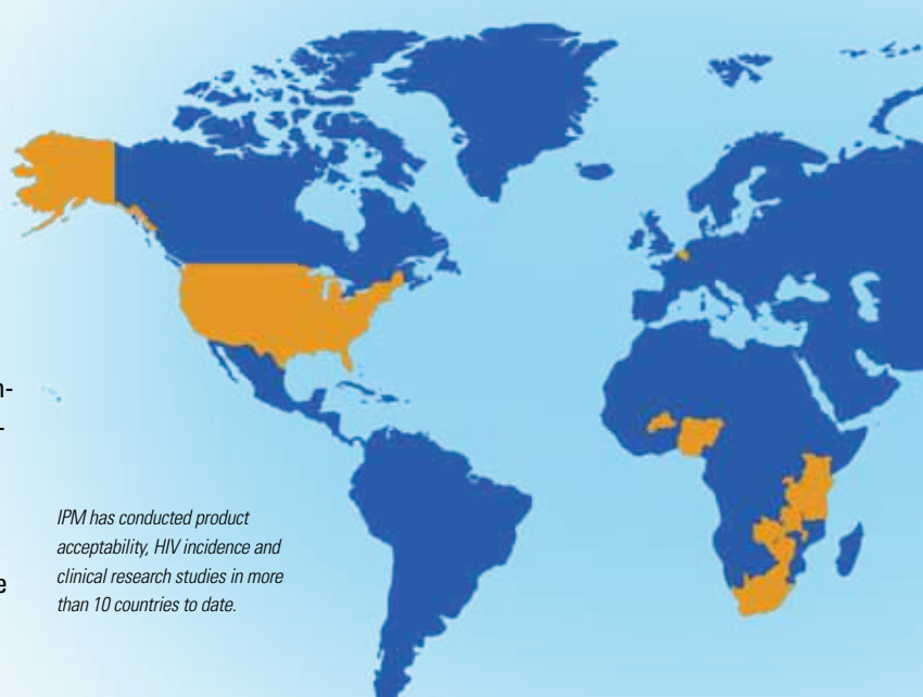
IPM has conducted product acceptability, HIV incidence and clinical research studies in more than 10 countries to date.

Long-term benefits of capacity-building: IPM’s studies are also benefitting the areas hardest hit by the HIV epidemic — by strengthening community understanding of HIV, expanding HIV testing and counseling, improving research capacity and access to health services, providing hundreds of employment and professional development opportunities, and supporting the development of frameworks such as community advisory boards. These research centers continue to serve their communities after trials end by conducting studies with other trial sponsors, expanding their research portfolios and supporting community health needs.