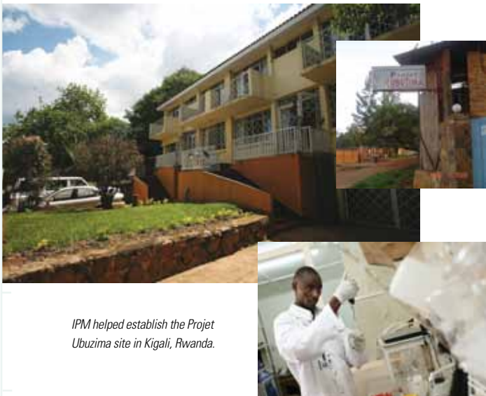
IPM helped establish the Projet Ubuzima site in Kigali, Rwanda.

With the license for dapivirine in hand, IPM began building on Janssen's earlier work to develop this potent ARV into daily gels and long-acting vaginal rings. To prepare for future clinical trials of these new products, we began in 2004 to build research capacity in Africa. IPM worked with the AMC-CPCD Foundation and other local groups to help establish Projet Ubuzima, a new research center in Kigali, Rwanda, that has participated in several IPM studies and will take part in our Phase III efficacy trial for the dapivirine ring, pending in-country approvals. IPM has since helped launch nine more sites in Africa, investing in infrastructure and staff training, and engaging governments, communities and individuals in our studies.