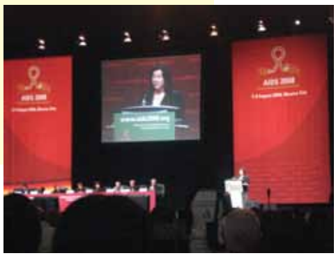
IPM presenting at an International AIDS Conference.

IPM has added to the body of scientific contributions in microbicide research through publishing peer-reviewed journal articles and presenting data at major international conferences, including the Conference on Retroviruses and Opportunistic Infections, the International AIDS Conference and the South African AIDS Conference. For example, in 2010 alone, IPM led or supported work that was featured in more than 20 oral presentations and 17 posters at the International Microbicides 2010 Conference.