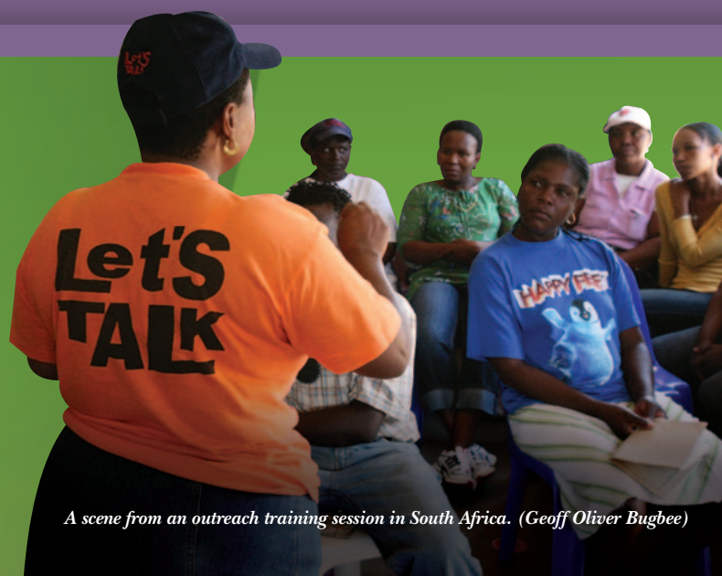
A scene from an outreach training session in South Africa. (Geoff Oliver Bugbee)