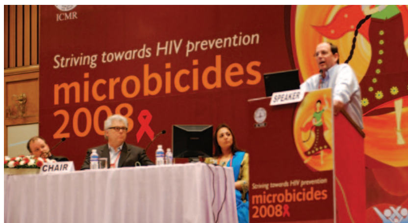
IPM representatives participate in a panel at the Microbicides 2008 conference in New Delhi.

IPM raised awareness about new prevention technologies during the UN review of the Declaration of Commitments on HIV/AIDS in New York. Along with the International AIDS Vaccine Initiative,