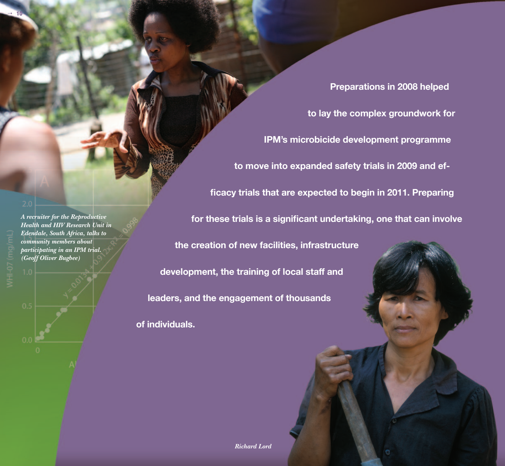
A recruiter for the Reproductive Health and HIV Research Unit in Edendale, South Africa, talks to community members about participating in an IPM trial.

Preparations in 2008 helped to lay the complex groundwork for IPM's microbicide development programme to move into expanded safety trials in 2009 and efficacy trials that are expected to begin in 2011. Preparing for these trials is a significant undertaking, one that can involve the creation of new facilities, infrastructure development, the training of local staff and leaders, and the engagement of thousands of individuals.