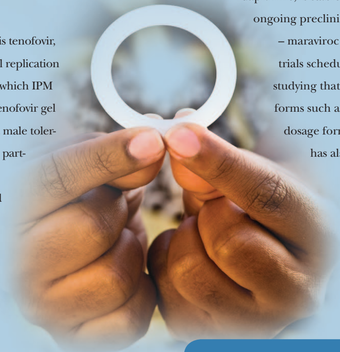
Andrew Loxley, Felt Photography

A combination including dapivirine and maraviroc is currently the most advanced in IPM's pipeline of potential combination products. Maraviroc is an FDA-approved therapeutic that, like dapivirine, is stable and affordable. IPM has a robust, ongoing preclinical programme for the dapivirine – maraviroc combination, with safety and PK trials scheduled to launch in 2010. IPM is studying that combination in sustained-release forms such as the vaginal ring and in daily-dosage forms, such as the gel or film. IPM has also initiated work on a combination maraviroc – tenofovir film.