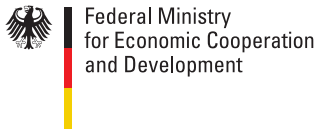
Germany Federal Ministry for Economic Cooperation and Development