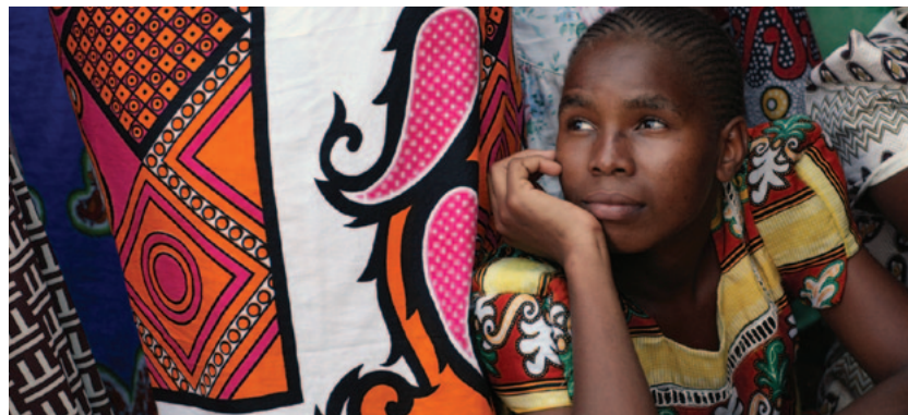
A woman in Mombasa, Kenya, watches a performance about HIV prevention by the drama group House of Courage. (Geoff Oliver Bugbee)

From its beginning, IPM has concentrated its efforts on what has become one of the most promising strategies in the field: ARV-based compounds. IPM and its partners are investigating these next generation microbicides, to be administered singly or in combination with other drugs. IPM is also developing a range of innovative topical dosage forms, including daily use gels, films, gel capsules and combination vaginal tablets as well as longer-acting vaginal rings that would be replaced monthly. Currently, IPM has royalty-free licensing agreements with five pharmaceutical partners for eight microbicide compounds.