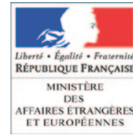
France Ministry of Foreign Affairs