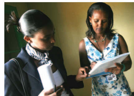
Community educators for Projet Ubuzima in Kigali, Rwanda.

The research centre teams were trained in areas such as clinical safety and data reporting, HIV testing and counselling, contraceptive and sexually transmitted infection counselling, quality assurance/quality control systems, Good Clinical Practice (GCP), Good Clinical Laboratory Practice (GCLP), laboratory project management, HIV rapid tests, financial processes and monitoring, and study participant recruitment and retention best practices, among other capacities. In addition, the September IPM Clinical Affairs Annual Meeting in Cape Town provided more training and a unique opportunity for 200 research centre attendees from a variety of countries in Africa, Europe and the United States to exchange ideas and best practices.